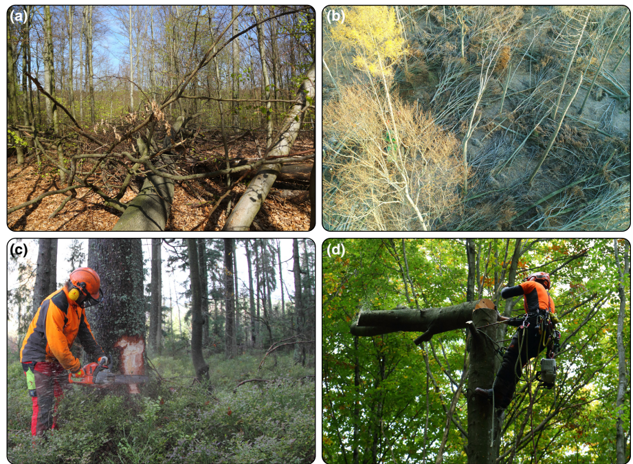
Figure 3. Deadwood creation in managed forests may encompass passive methods, such as (a) the retention of tree crowns with low economic value in selective-logging systems and (b) the partial or complete set-aside of areas affected by natural disturbances for natural succession; and active methods, such as (c) girdling a vital tree to initiate tree death and (d) topping of trees to create sun-exposed high stumps.

selected both as a flagship species for deciduous forest conservation and as a tool for communicating deadwood conservation (Roberge et al. 2008).