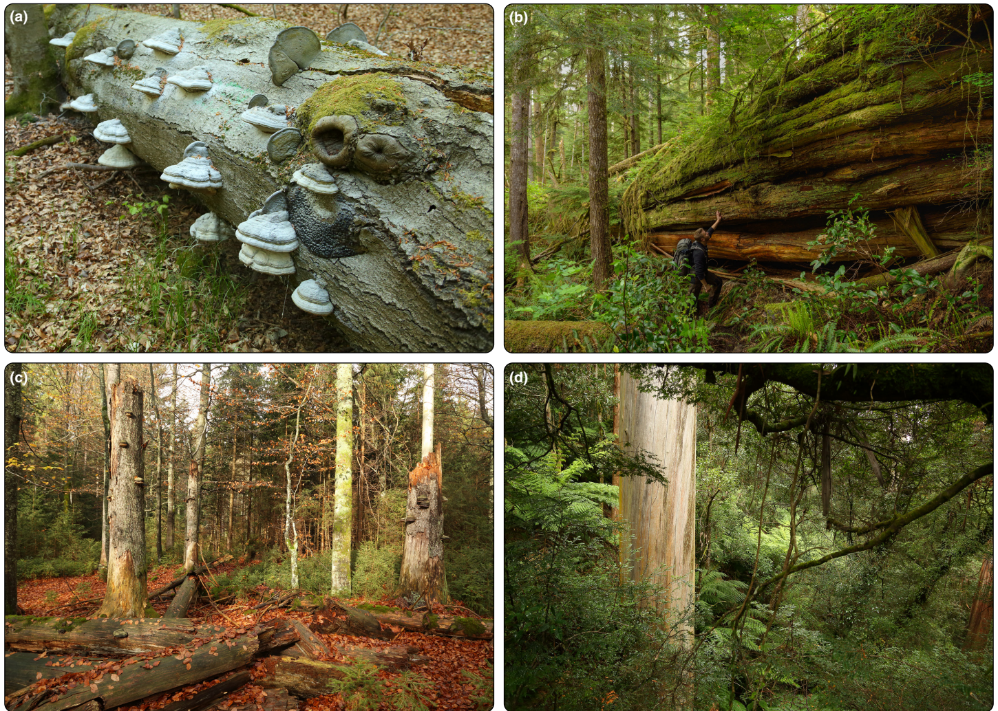
Figure 1. Deadwood structures characteristic of old intact forests include (a) fallen logs with large numbers of fruiting bodies of wood-inhabiting fungi; (b) large logs in an advanced state of decay, which facilitate the regrowth of natural vegetation, such as in old-growth forests in the US Pacific Northwest; and (c) standing dead old trees created by natural disturbances like bark-beetle outbreaks. Such dead trees can persist for decades and are often sun-exposed ecological islands in otherwise closed canopies, such as in (d) old-growth mountain ash ( Eucalyptus regnans ) forests in Victoria, Australia.

At present, deadwood removal includes, for instance, fuel wood and stump biomass extraction (Jonsell 2007), selective logging of high-value large old trees (Ahrends et al.