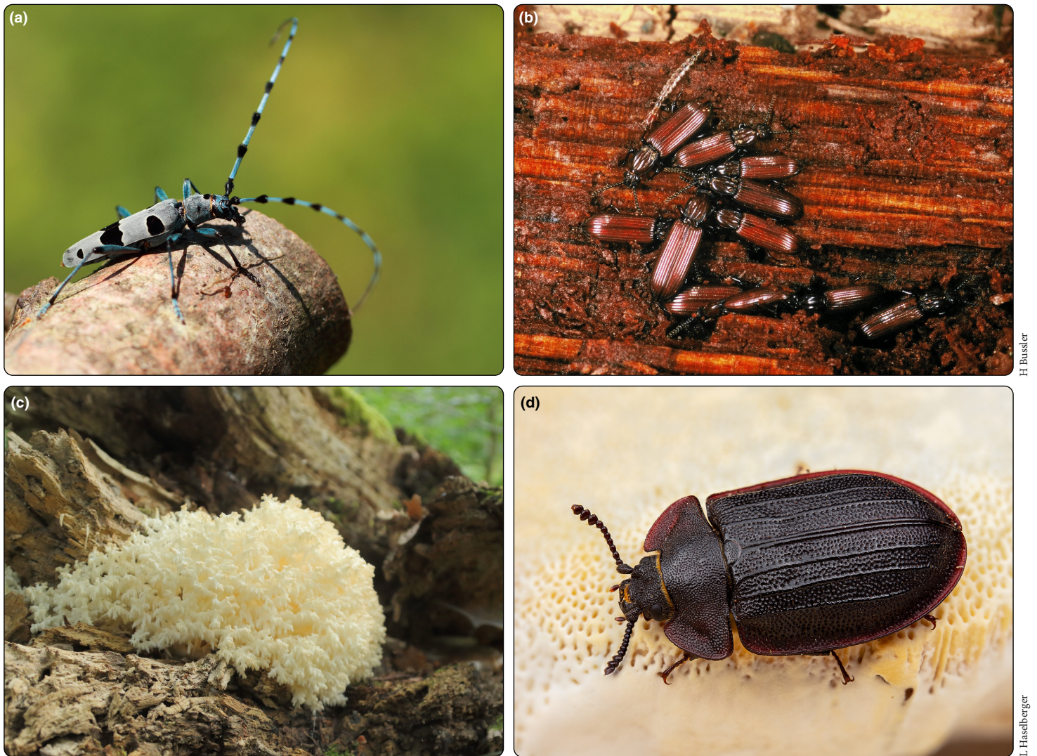
Figure 2. Species inhabiting deadwood structures include (a) the Rosalia longicorn ( Rosalia alpina ), which is protected by the European Commission's Habitats Directive and breeds in large, sun-exposed, dead deciduous trees; (b) the rare wrinkled bark beetle ( Rhysodes sulcatus ) inhabiting advanced brown-rot decay stages of large-diameter trees; (c) the rare wood-inhabiting fungus ( Hericium coralloides ), which is now restricted to old-growth forest reserves; and (d) the bark-gnawing beetle ( Peltis grossa ), which is strongly dependent on wood subject to fungal decay.

The importance of deadwood as habitat for insects was recognized early on, including by naturalists searching for previously undescribed species in the late 19th century (Wallace 1869) and ecologists in the early 20th century (Graham 1925). By the end of the 20th century, the historical ranges of several species had been greatly reduced due to overexploitation of deadwood (Figure 2). For instance, the wrinkled bark beetle ( Rhysodes sulcatus ) has been extirpated from large parts of Europe for more than