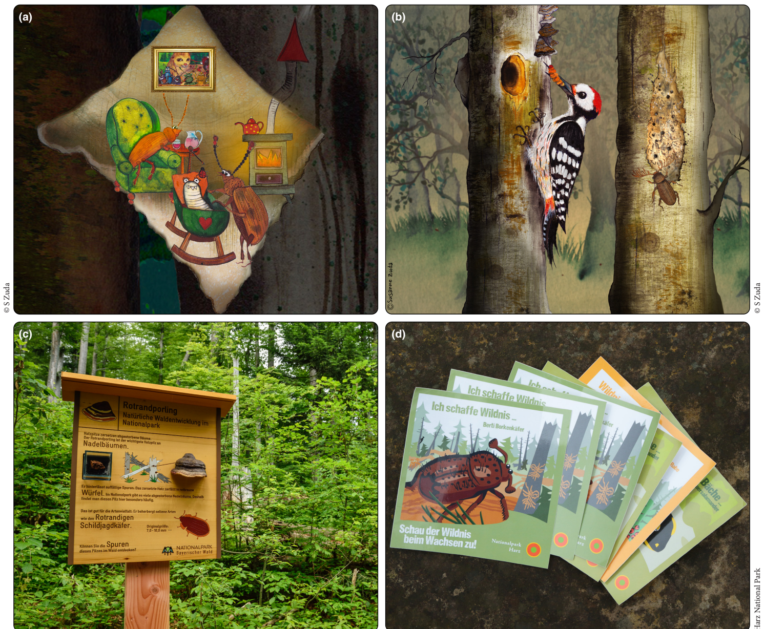
Figure 4. Environmental education programs may emphasize the importance of deadwood through illustrated children's books about (a) the life history of relict species within primary forests and the important role of saproxylic invertebrates as food resources for higher trophic level species, such as (b) the white-backed woodpecker ( Dendrocopos leucotos ) feeding on larvae of the wood borer ( Ptilinus pectinicornis ). These programs may also rely on resources such as (c) information panels posted in forests describing the importance of deadwood for forest biodiversity and the interactions between wood-inhabiting fungi and saproxylic beetles, and (d) stickers of "Berti" the bark beetle highlighting the natural dynamics that lead to the creation of deadwood.

scientists, and the general public. To limit forest degradation and to promote ecologically sustainable forest management, we recommend specific policy reforms, including the (1) development of ecosystem-specific minimum thresholds for large, old trees and amounts of deadwood that are benchmarked against levels in natural forests; (2) promotion of management practices that recruit particularly large, old trees and increase natural amounts of deadwood by natural tree dieback; (3) introduction of educational programs that improve understanding of the ecological importance of deadwood