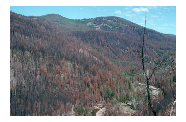
Fig. 2. Mixed-severity fires (fires that leave recognizable patches of low-severity, medium-severity, and high-severity effects) typify the majority of mixedconifer forest systems in the western United States. The brown-needled and blackened areas harbor unique sets of plant and animal species found in no other forest conditions. This photograph of the North Fork of the Blackfoot River was taken 10 months after the 1988 Canyon Creek fire in Montana. Many fire-dependent plant and animal species were present in the more severely burned areas until they were helicopter logged, suggesting that unburned forests might be a better alternative for timber harvest.